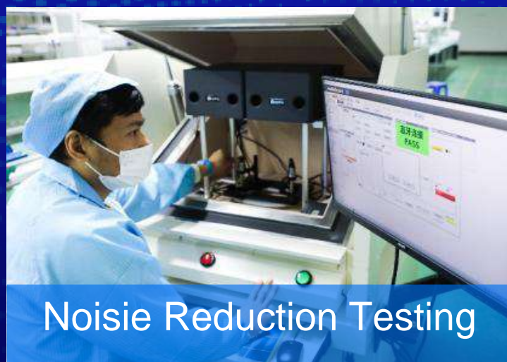
Noise Reduction Testing