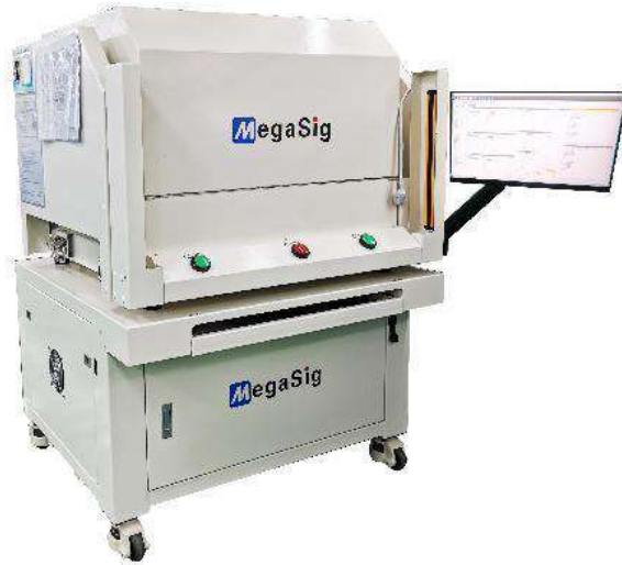
Test Equipment for Hearing-aids