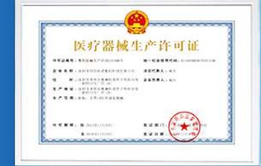
Medical Device Prod uction License