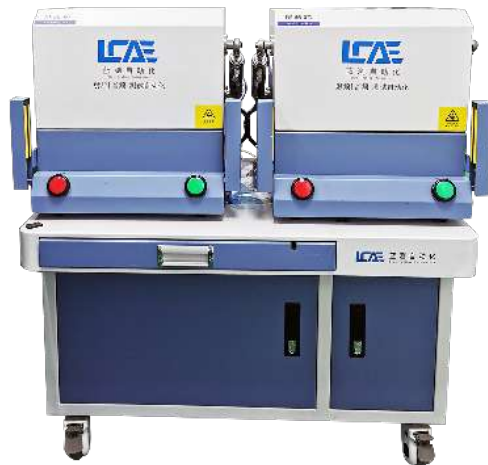
Test Equipment for RF