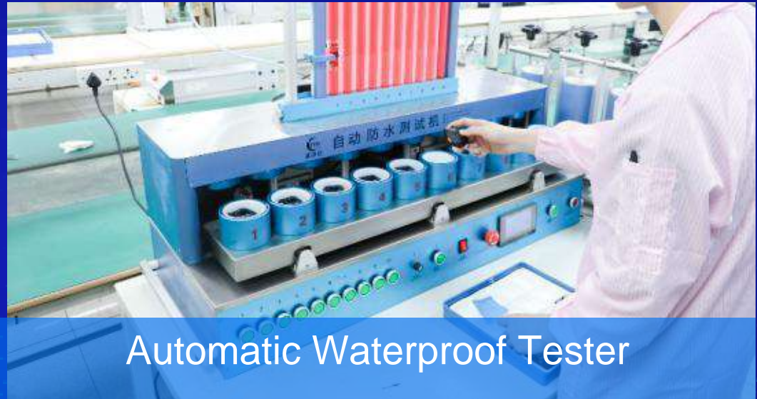
Automatic Waterproof Tester