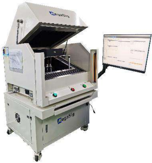
Test Equipment for Audio