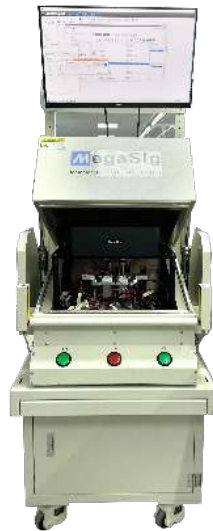
Test Equipment for ENC