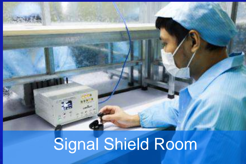
Signal Shield Room