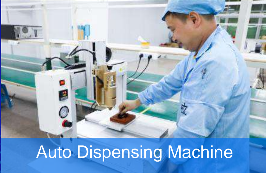
Auto Dispensing Machine