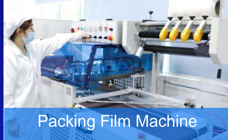
Packing Film Machine