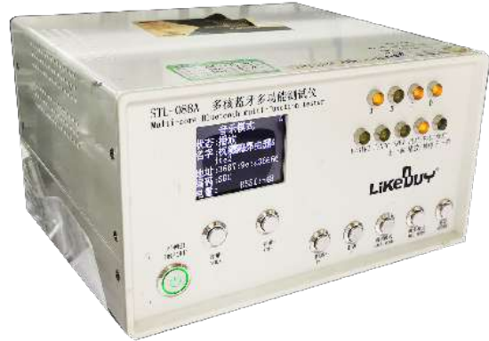
Test Equipment for Bluetooth