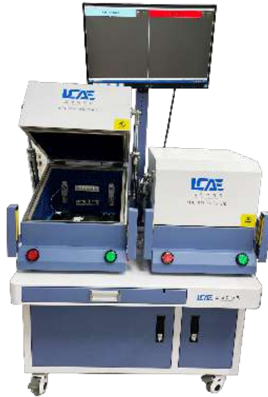
Test Equipment for Audio