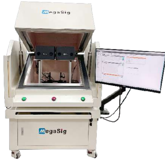
Test Equipment for ANC