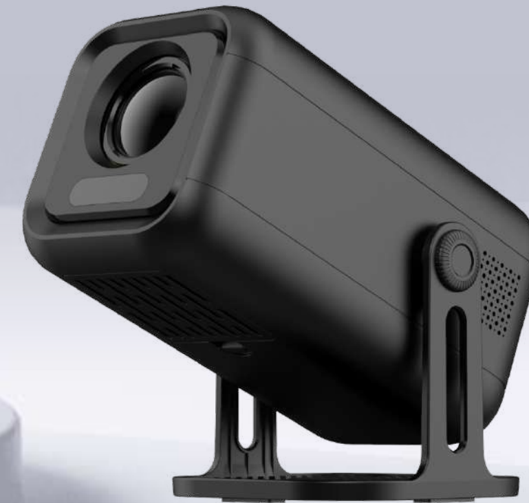
SMART HOME THEATER PROJECTOR 1080P Projectors