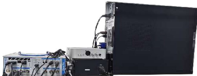
Acoustic test equipment