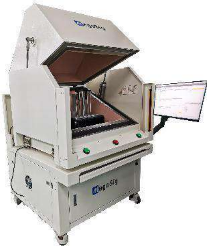
Light Sensitivity Test Equipment